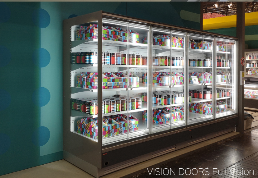
VISION DOORS Full Vision

VISION , verticali multipiano e multiprodotto. Dotati di porte a vetro, anche full vision, danno massimo risalto e appeal emozionale ai prodotti esposti e contengono sempre più le dispersioni termiche, nel segno della salvaguardia dell'ambiente e del risparmio energetico.