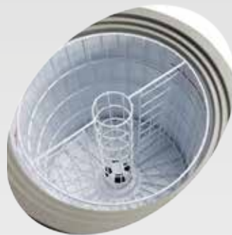
CC77-I fan and basket