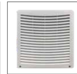
Standard ventilation grid