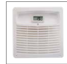
Ventilation grid with digital thermometer