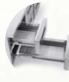
Versione con cassetti interi o doppi Full or mid-size drawers