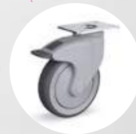
Ruote (optional) Castors (option)