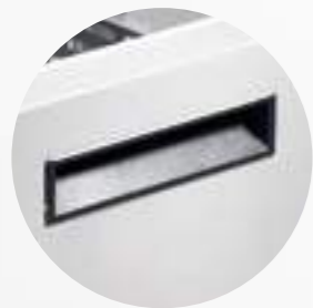
Vani cassetto con maniglia orizzontale e guarnizioni ad incastro Drawer compartments with horizontal handle and snap out gasket