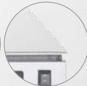
Versioni con piano lavoro dritto, invaso o senza piano Versions with straight recessed worktop, or without top