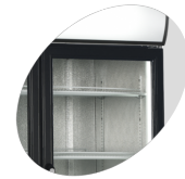
Vertical LED light