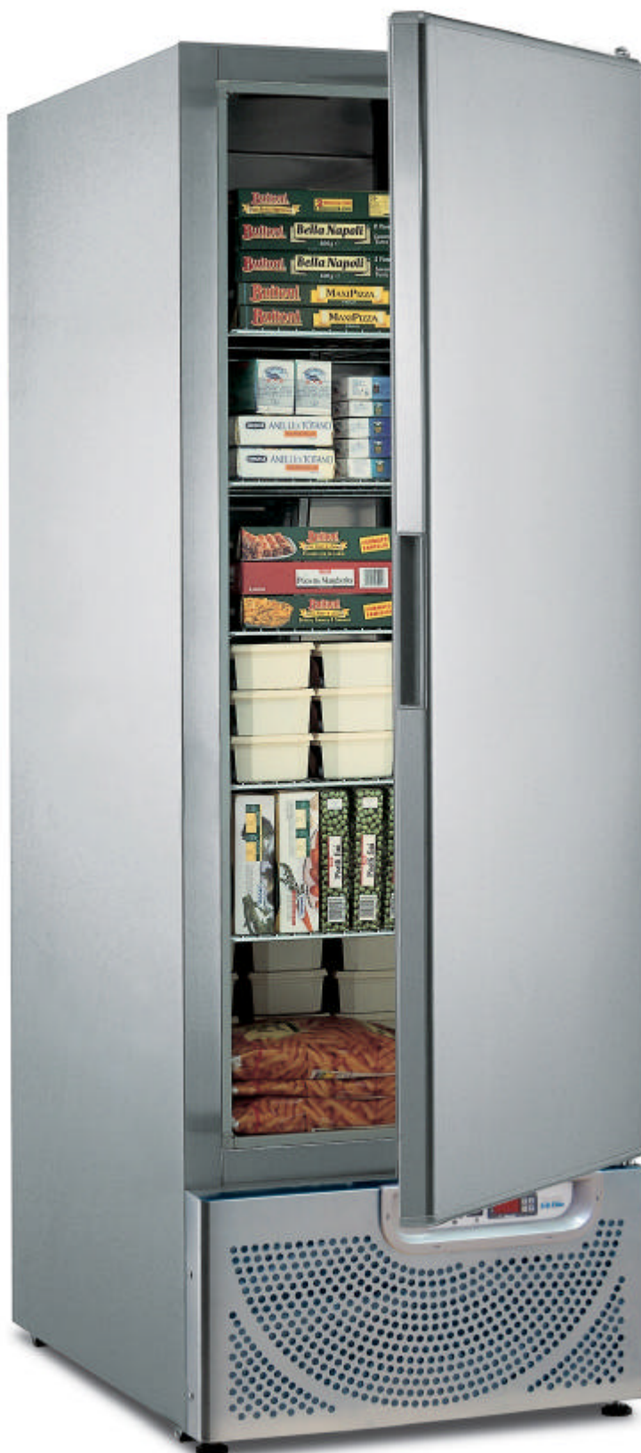
CHEF 600 NX

The manufacturer will reserve the right to make any modification without prior notice.