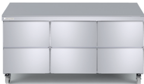
SD-72 con cajoneras opcionales with optional drawers sets